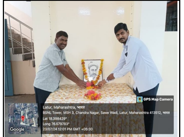
Library staff paying floral tributes to the image of Lokmanya Bal Gangadhar Tilak